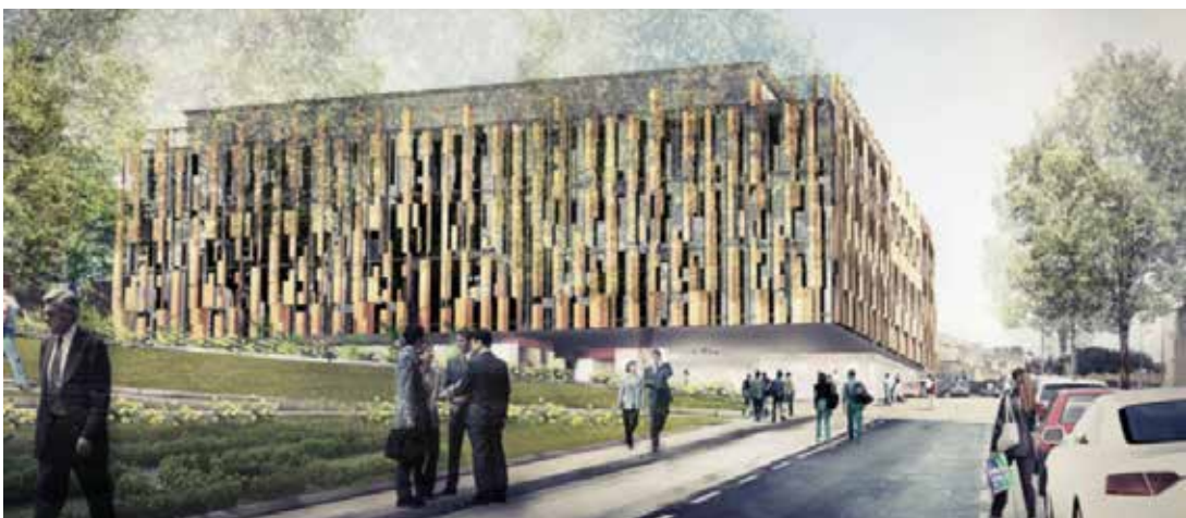
Marsa Spencer Hill Exchange

The Marsa Spencer Hill Exchange is situated on inclined ground with no unusual characteristics. It has a frontage on three roads as follows: approximately 52.8m on Triq Spencer, Marsa (where the main entrance is situated), 19m on Triq Nazzjonali, Marsa and 53.3m on Triq tal-Hatab, Marsa. The total area of the building is approximately 2,663m 2 . The surrounding properties are generally of a commercial/ industrial type, most of which are set within warehouses, with offices being the predominant commercial use in the area. The existing property consists of a three storey building and surrounding grounds and outbuildings used by the GO Group mainly as a telecommunications exchange, offices and equipment rooms with ancillary spaces. Over the next few years the GO Group plans to vacate its operations from most of this building.