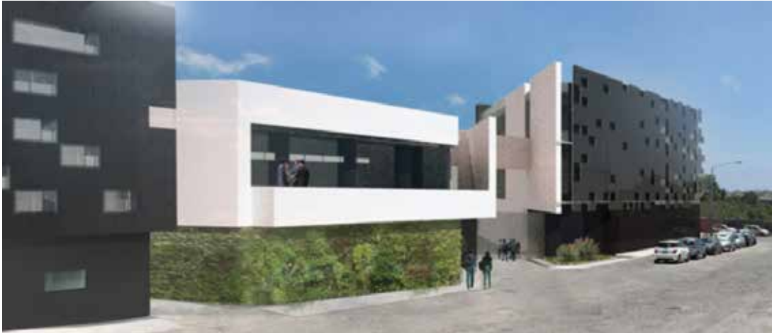
The proposed Żejtun Exchange Development

A development application for demolition of existing buildings that will not be retained in the proposed project was approved by MEPA in July 2015 and will allow for works on site to commence before the end of 2015. Another development application for construction of offices, a data centre and training facilities was submitted in late 2014. A development permit for the proposed project is expected in 2016 and construction to completion will take place during 2016 – 2018. The project is estimated to cost circa €8.5 million and will be financed through bank funding.